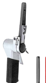
Pneumatic belt sander (10x330mm) 052819

Find out more about the workstation's features here