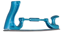
Car body shredder 051423